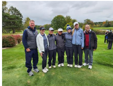
Regionals '23 2 nd place team